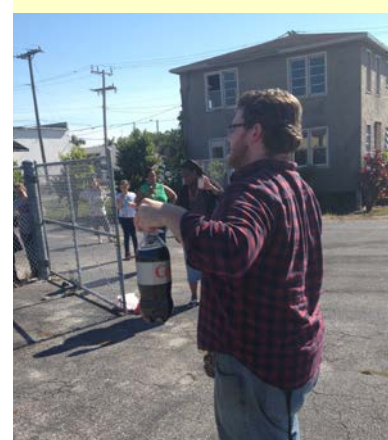
Exploding Science Project