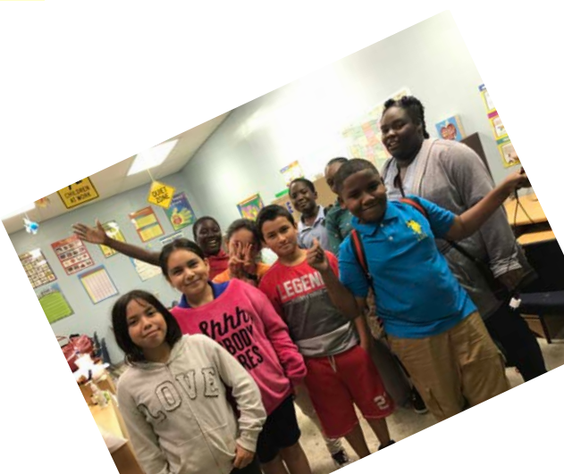
Middle School Students

GAP Christian Academy held its sixth annual Thanksgiving Feast on November 17. Over 70 family and friends attended and many brought delicious food from home that represented many different cultures. Of course, there was the traditional turkey plus stuffing, gravy, mashed and sweet potatoes, rolls, and plenty to drink. The k-2 nd grade students sang some songs and acted out stories about the first Thanksgiving.