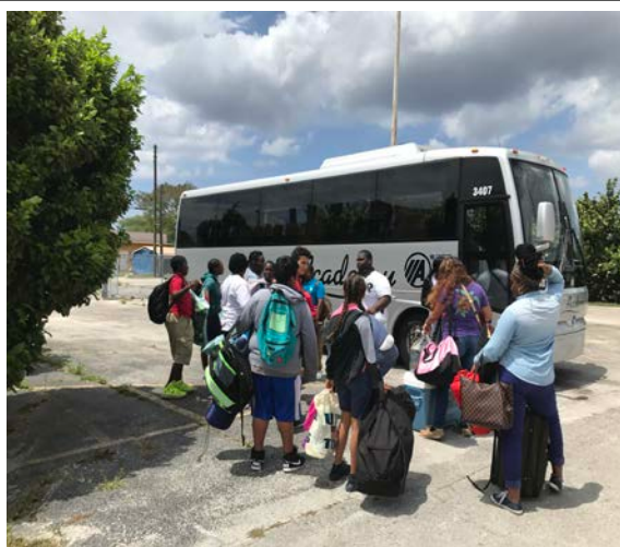
First Overnight Trip for GAPCA - Seaworld Orlando!!