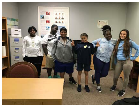
Middle/High School Students